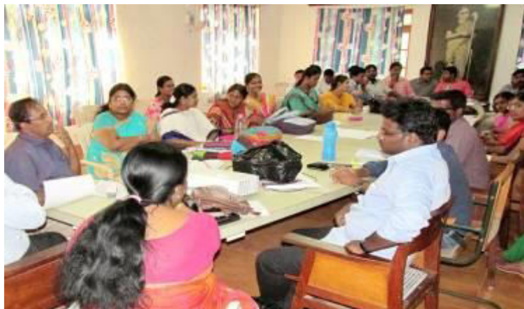
Managerial Skill Training to MOs of GPHCs