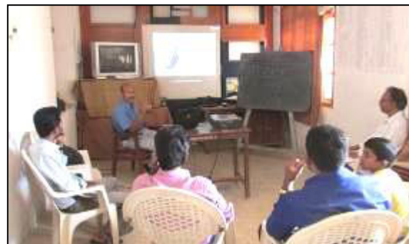
Short Course on Digital Photography