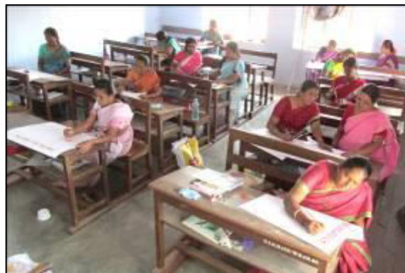
Media Practical for Health Visitors Course trainees