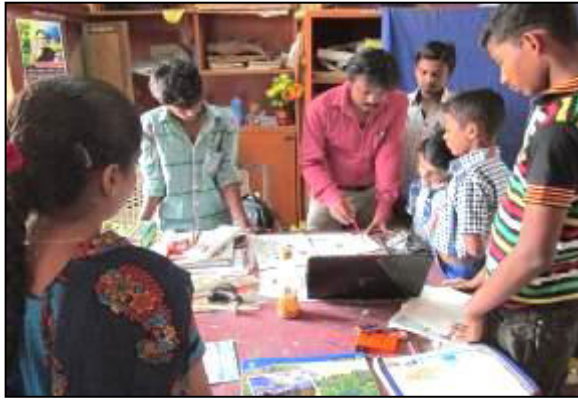
Short Course on Fine Arts