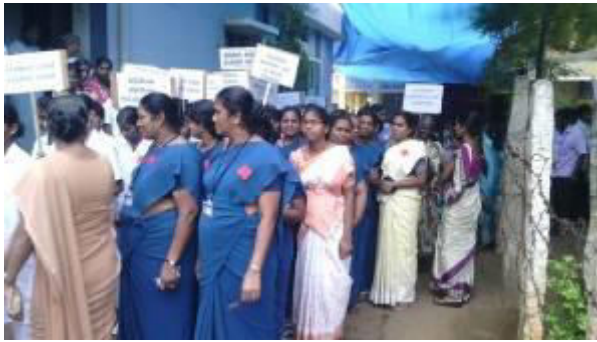
HIV/AIDS Awareness Rally