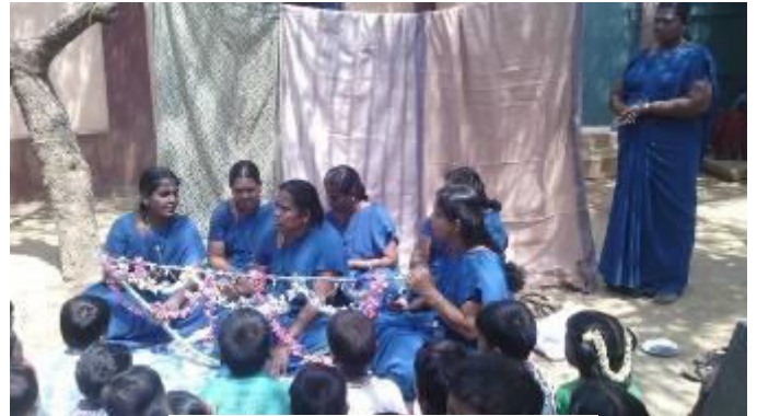
Village Health Education Program