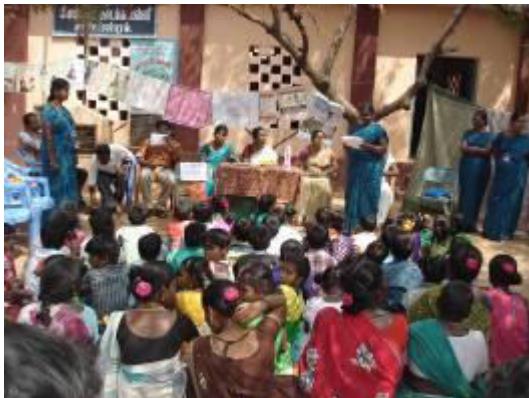
Orientation Training Camp