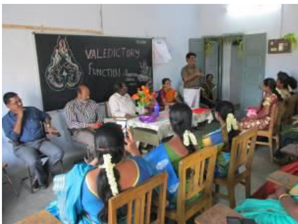
Health Visitors Course Valedictory