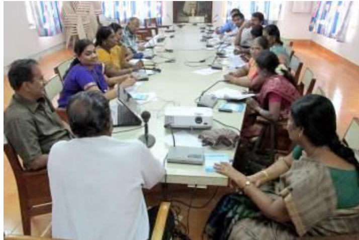
District Training Coordination Meeting attended by District Training Team MOs and District Maternal Health Officers-Director, Principal and Faculty of HFWTC attended