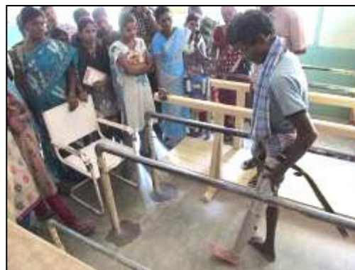
Refresher Training on Disability Care