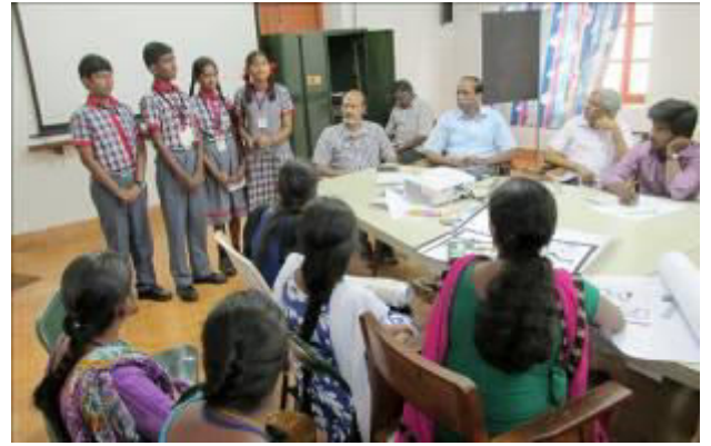
Media Workshop on Peace, Justice & Social Development