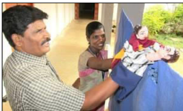
Training on Puppet Preparation & Manipulation