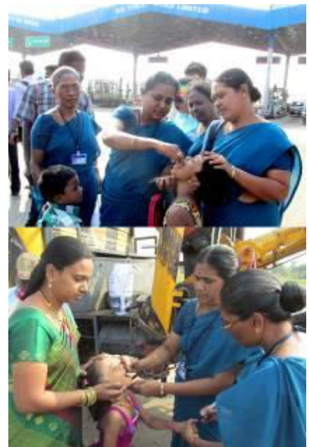
Pulse Polio Program