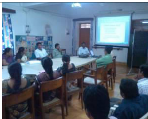
Training on Communicable Diseases held on 29.10.2014