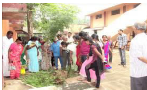
Special Training on Training Medicines