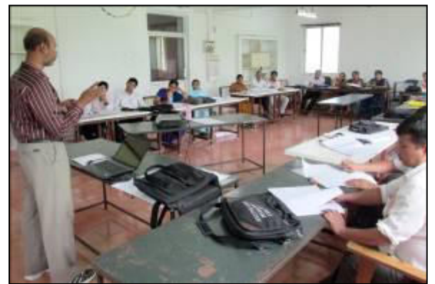
Media Practical for PGDHPE trainees