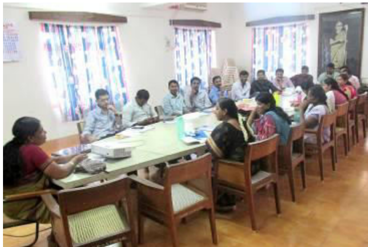
Managerial Skill Training to MOs of GPHCs