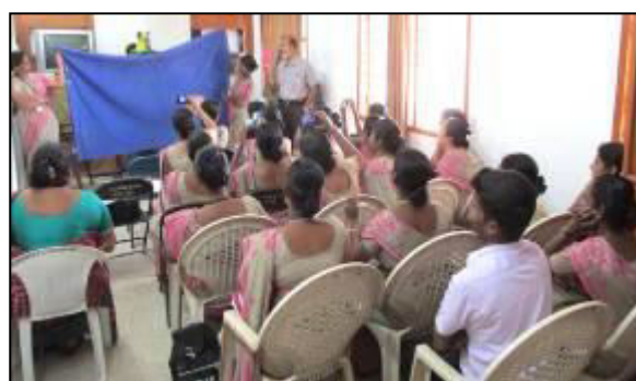
One day special training on IEC for M.Sc.(N) students